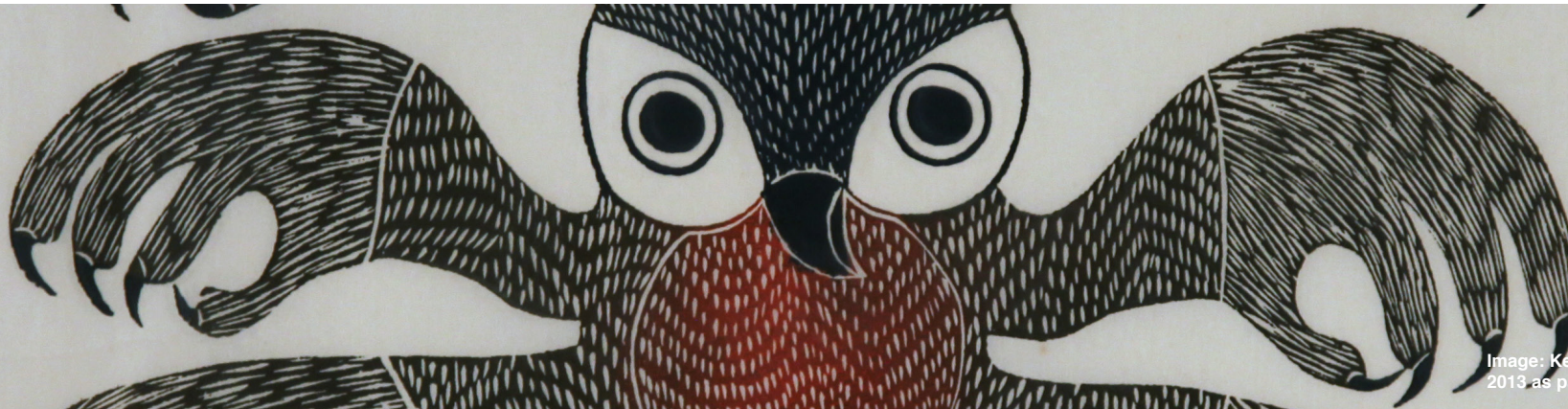
Image: Kenojuak Ashevak, Owl Spirit (detail), 1969. Acquired in 2013 as part of a gift from Jim Coutts.