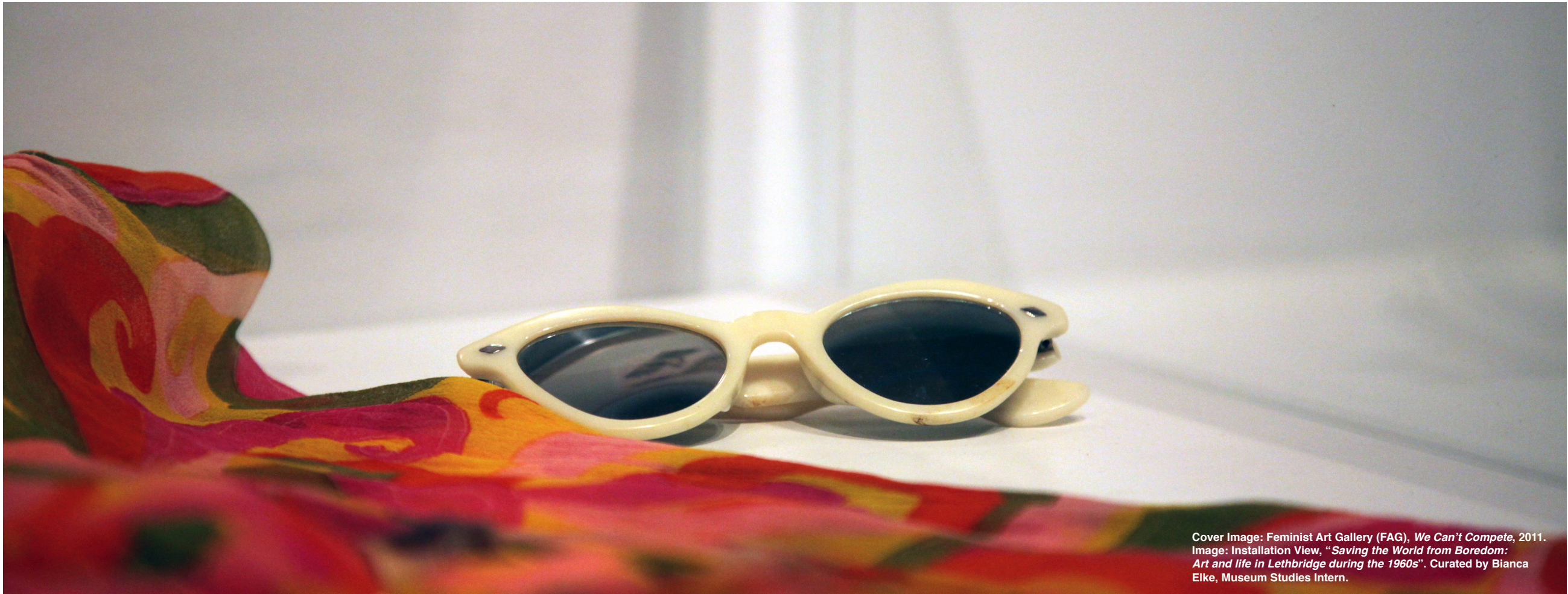
Cover Image: Feminist Art Gallery (FAG), We Can't Compete , 2011. Image: Installation View, "Saving the World from Boredom: Art and life in Lethbridge during the 1960s" . Curated by Bianca Elke, Museum Studies Intern.

The University of Lethbridge Art Gallery is a forum for the exchange of ideas; a site that supports and invites interdisciplinary discussion; a place for contemplation; a meeting point for students, faculty and staff; a connection point between people on and off campus; and a partner in or producer of interdisciplinary projects. The ideas and issues addressed in the art works we display, manage, reproduce, and interpret are a source for this kind of exchange and build on existing interdisciplinary discussions.