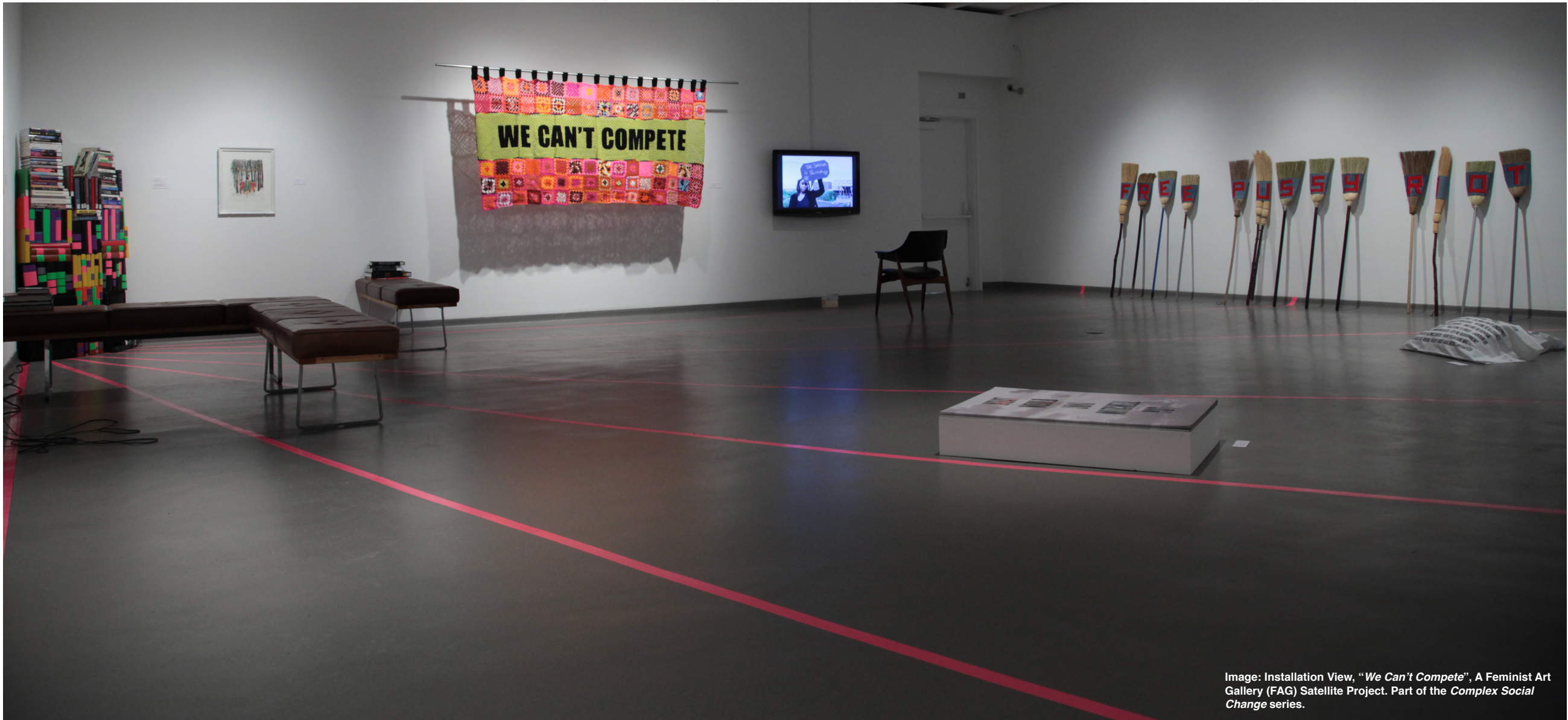
Image: Installation View, " We Can't Compete ", A Feminist Art Gallery (FAG) Satellite Project. Part of the Complex Social Change series.