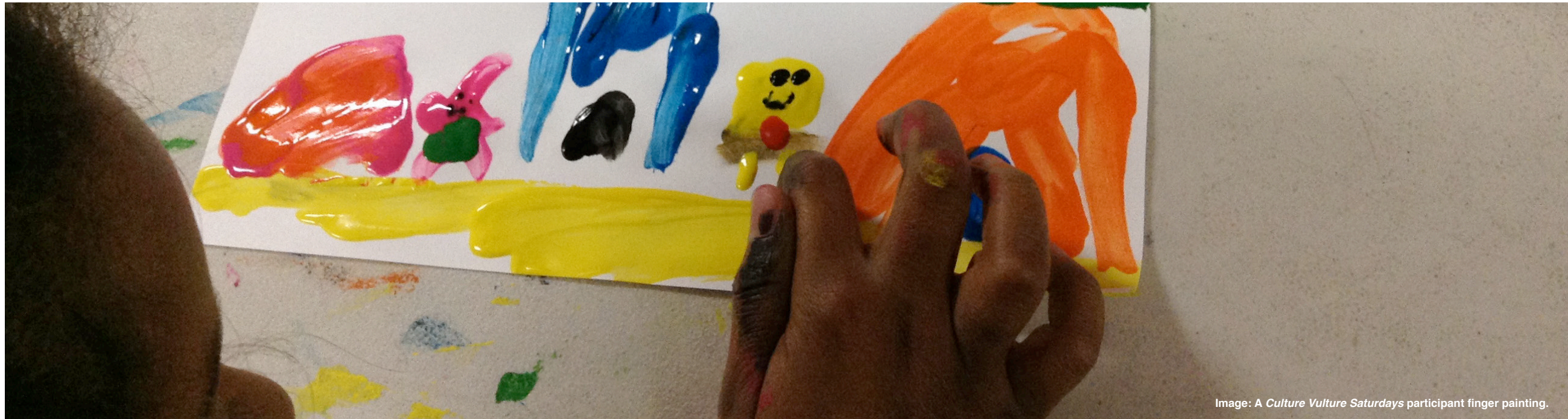
Image: A Culture Vulture Saturdays participant finger painting.

Faculty of Fine Arts event, February 26, 2014