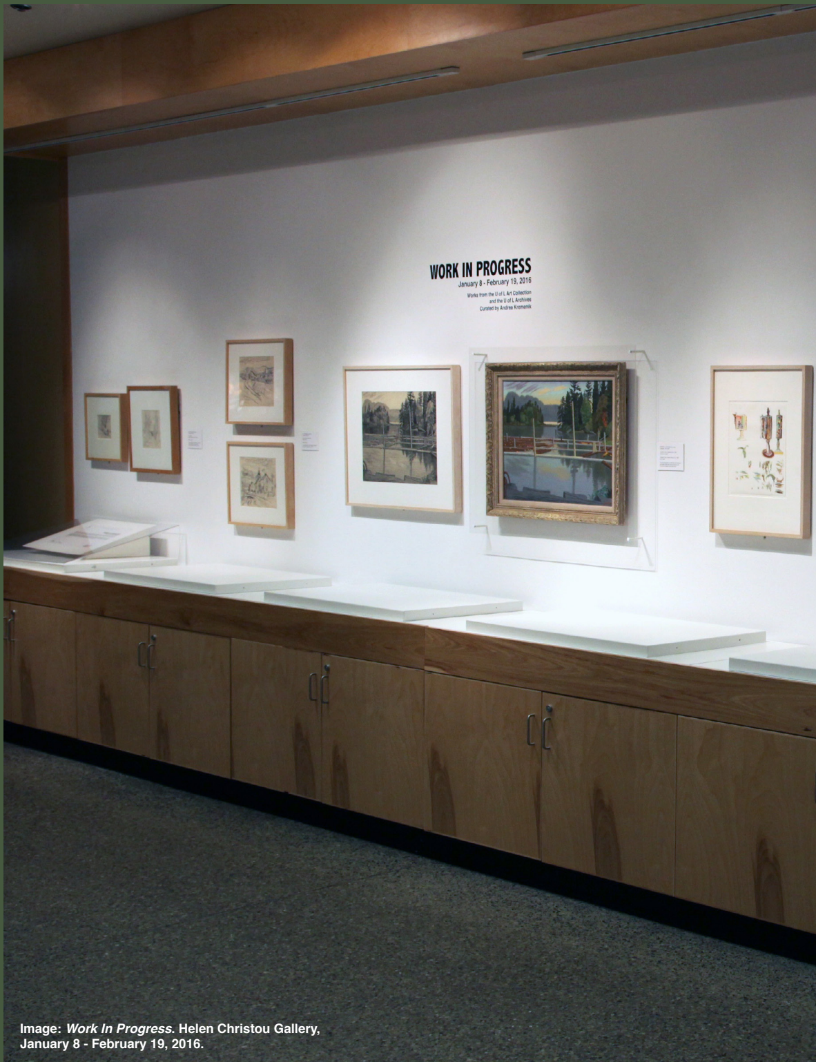
Image: Work In Progress . Helen Christou Gallery, January 8 - February 19, 2016.