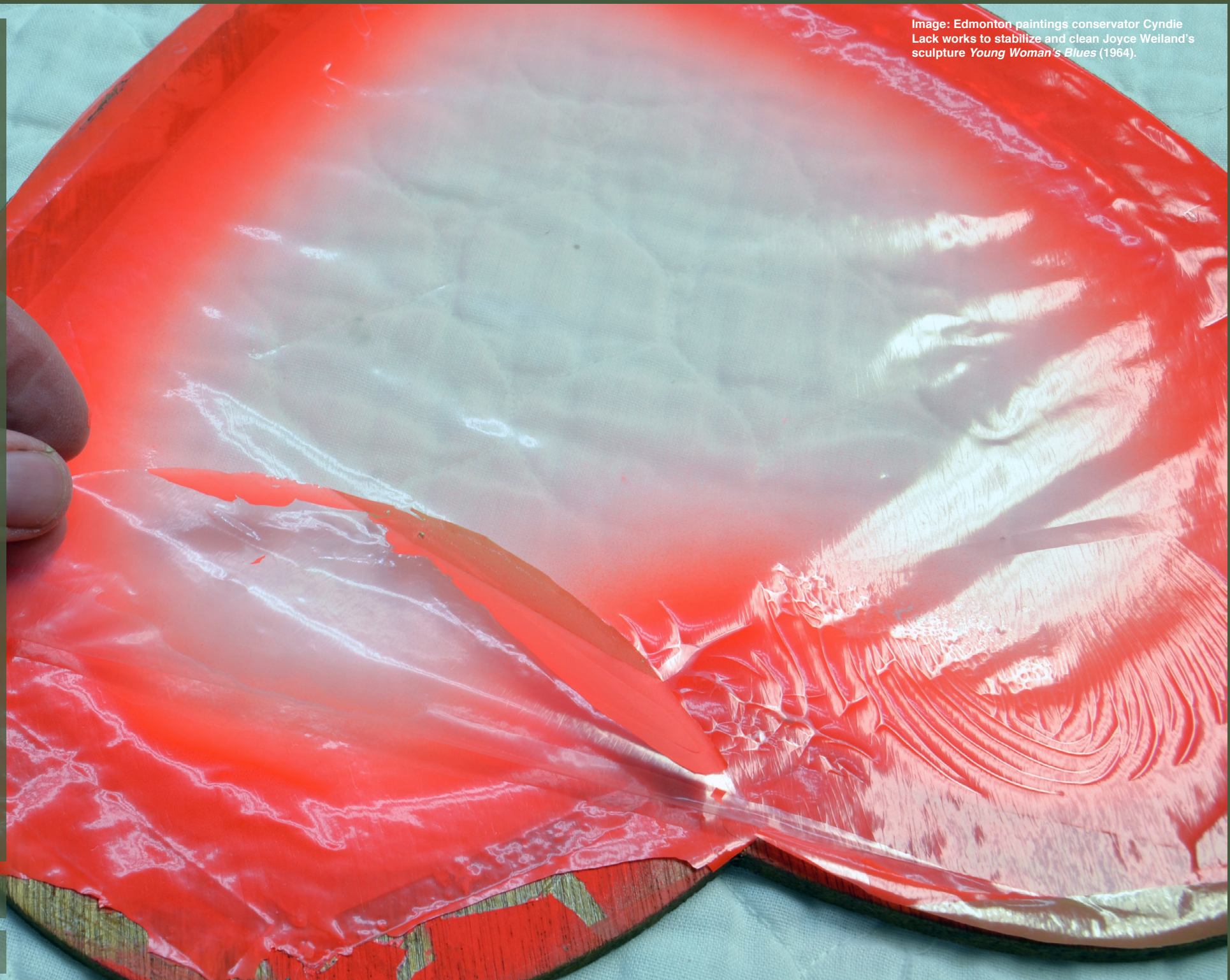
Image: Edmonton paintings conservator Cyndie Lack works to stabilize and clean Joyce Weiland's sculpture Young Woman's Blues (1964).

U of L Art Gallery staff and interns worked on the oldest beer bottle from the Sick Brewery in the Galt Museum and Archives collection, from 1905, and one of the first designs produced by the brewery. The upper label on the bottle had popped off the bottle after its recent donation to the collection. The bottle had been found in a wall by contractors working on a Lethbridge building and as a result, the label was dirty and torn. To re-adhere it needed to be washed, flattened and reattached using isinglass, an adhesive made from the swim bladder of a sturgeon or cod. Fun fact: isinglass is also used for clarification in the production of beer, so it probably would have been used inside this bottle too!