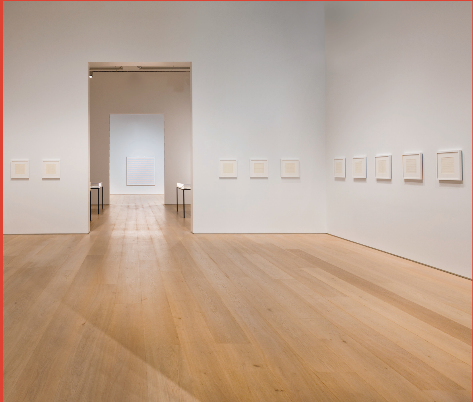
Image: Loaned Agnes Martin prints on display at Esker Foundation, Calgary, Alberta for Agnes Martin: the mind knows what the eye has not seen , September 22 - December 21, 2018.