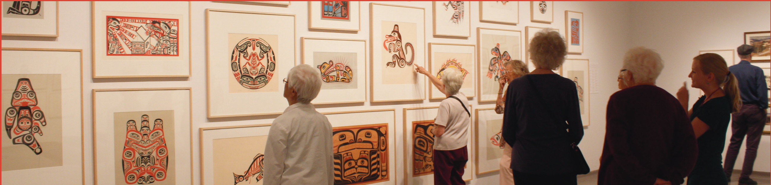
Image: Gallery Tour - Seasons Retirement Community, August 20, 2018.

The Everyday Future - Camper Trailer in the Grove